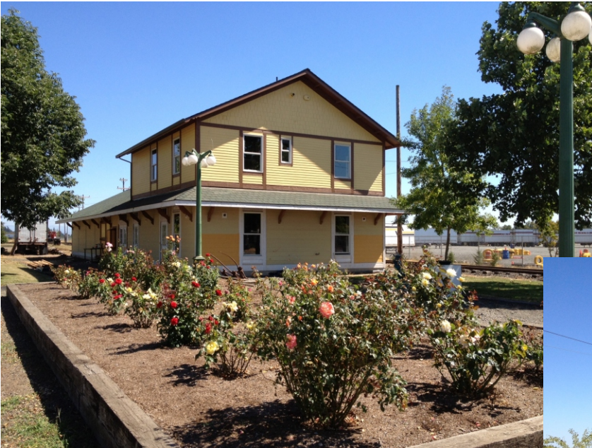
The new Interpretive Center, recently painted.