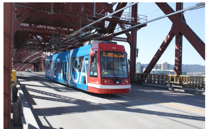
Car 015 on the Broadway Bridge on opening day of the Eastside Loop.