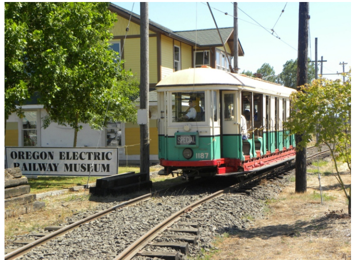
Car 1187 passing the newly painted Interpretive Center.