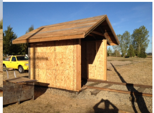
Greg Bonn busy building the Motor Car Shed.