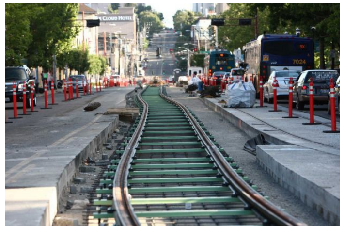
Rail construction on Broadway showing detail that will eventually be encased in concrete, August 2012.

The Lakewood extension plans to open October 8 initially with 5 peak hour trains daily to Seattle. The trains operate out of the Lakewood station that was opened in 2008 with bus service.