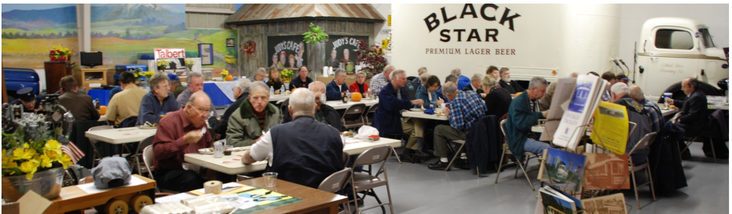
Last year's Annual Meeting & Banquet, November 2011