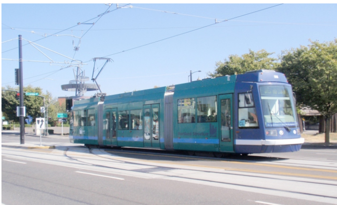
Car 006 pauses briefly at the Rose Quarter headed East.