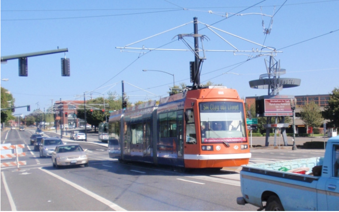
Car 005 is about to cross the Willamette River on the Broadway Bridge.