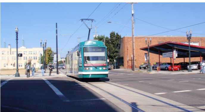
Car 006 headed south-bound on Martin Luther King Blvd.