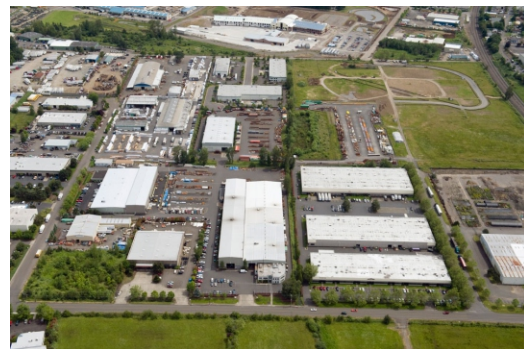
United Streetcar's Clackamas facility.

Portland has the distinction of being home to United Streetcar, the only manufacturer of modern streetcars in the United States. United Streetcar is currently fabricating five additional streetcars for the City of Portland's East Side Loop Extension, and seven streetcars for the City of Tucson's new streetcar project. Ten years ago, Portland became the first city nationally to reinvest in streetcars, eventually building a 4-mile line stretching from the Pearl through downtown to the South Waterfront. That line relied on European-built streetcars. The Portland streetcars are nearing completion with final testing in progress now. Here are some photos of the new cars being built in the Clackamas-based facility.