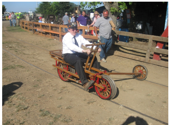
Velcopede during Steamup two year ago. One of the Speeder guys brought it down and let us "play with it".