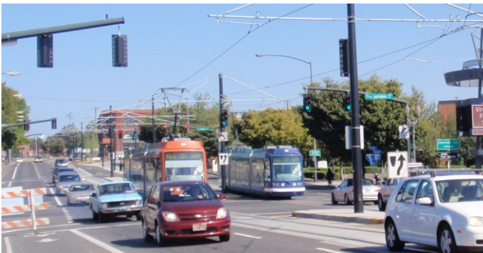
Cars 005 and 006 passing each other just east of the Broadway Bridge at the Rose Quarter.