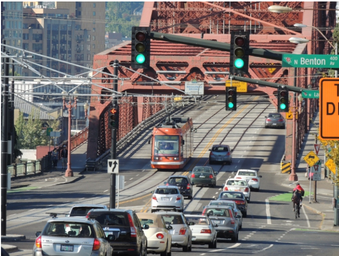
It has been many years since streetcars have crossed the Broadway Bridge. Car 005 headed East from the Pearl District on the west side of the Willamette River.

On Saturday, September 22, 2012, Portland Streetcar opened its long planned Central Loop connecting the existing streetcar line in the Pearl District in downtown Portland to the Eastside. The original line opened in the downtown area in 2001. This new loop will begin in Northwest Portland on 10th and 11th Avenue, crossing the Broadway Bridge traveling on Broadway, Weidler St, 7th Ave, Martin Luther King Blvd and Grand Ave, to the Rose Quarter, Lloyd District, Oregon Convention Center, Central Eastside Industrial District and ending at OMSI parallel to the Willamette River in Southeast Portland. This is the first project in the country where the new vehicles are manufactured by United Streetcar located in Clackamas, Oregon and the project is partially funded by a Federal Grant.