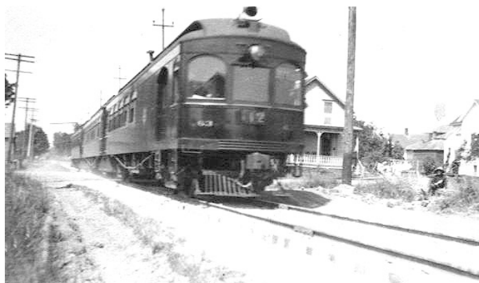
OE train #17 southbound with combo 63 leading a 3 car train that had departed Portland at 6:05 PM.

James J. Hill owned the GN, NP, CB&Q and the SP&S (the northern lines) and Edward H Harriman owned the UP and SP and were fierce competitors. Hill saw an opportunity to purchase a profitable railroad that he would build south to take business away from the Harriman lines.