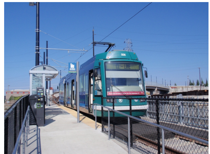
Car 006 at the end of the line at OMSI