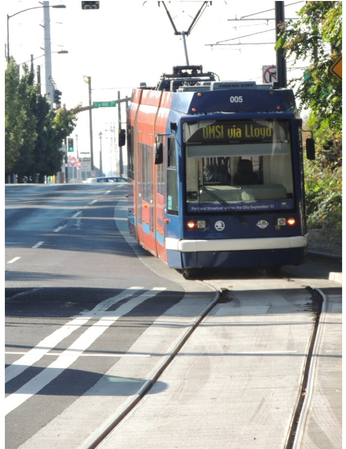
Car 005 on MLK Blvd.