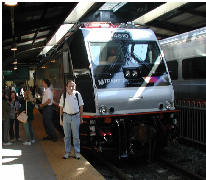
NJ Transit locomotive in Hoboken, NJ during a festival back in 2002.