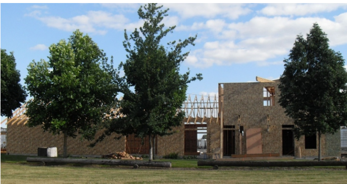
Walls taking shape on July 2nd.