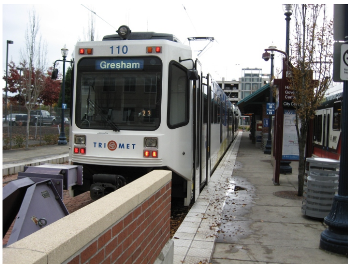
MAX 110 in Hillsboro at start of Excursion

Since I planned to attend the OERHS annual meeting and banquet on Nov. 19, 2009, I felt it was time to ride MAX and the Portland Streetcar line, all 56 miles, since I had only ridden the Blue Line twice. We planned to ride and photograph all four classes of LRV's in 7 hours in one day. The MAX schedules were used to plan the itinerary. The plan assumed that the trains would run on time; maybe it wasn't wise to assume. Dick Harrison was interested so the following Monday the excursion started in Hillsboro. It was convenient for us and was a safe place to leave our cars. So, do you think we achieved our goals?