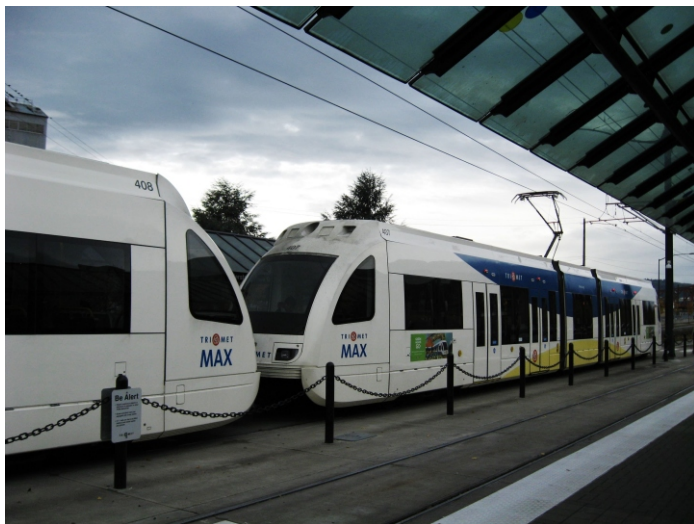
MAX408 & 407, we were unable to ride the type 4 cars. as they were heading in the wrong direction.

We quickly decided to forget the itinerary and take the first train to arrive, whether it be to the Airport or Clackamas Town Center, it didn't matter. While we were waiting, trains were all