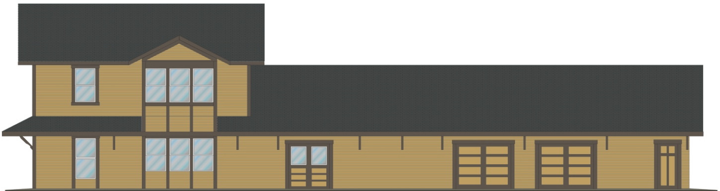
Artist's rendering of OERHS Interpretative Center. The building is located along the trolley right-of-way at Antique Powerland. It is located across the "street" from the Pacific Northwest Truck Museum, near where the trolley crosses the main street in Powerland.