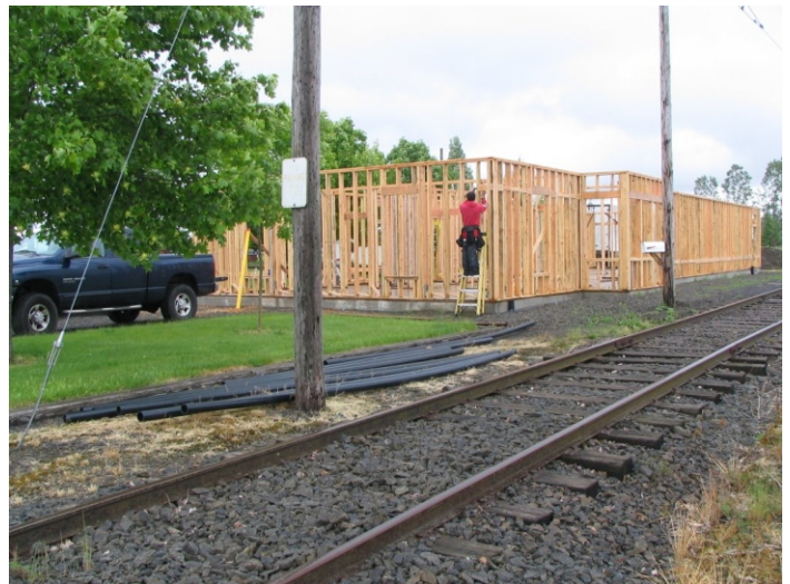
Framing work in process June 2nd.