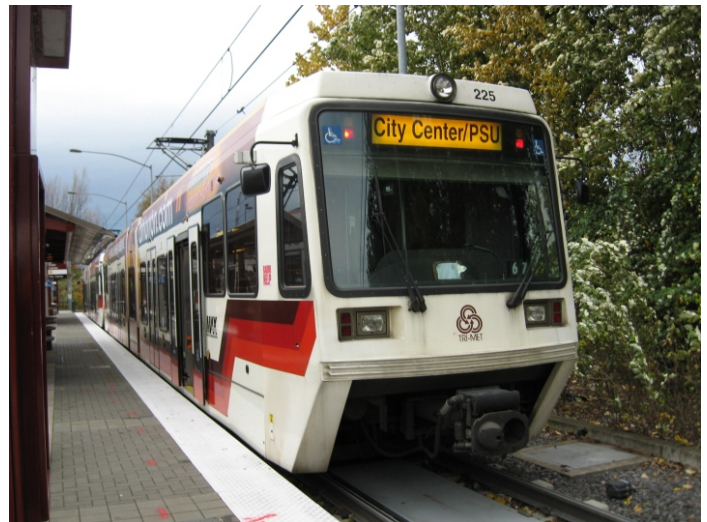
MAX 225 on the Yellow line at the Expo Center

Passengers are not allowed to ride the turnaround by PSU 5th to 6th so we walked over to the Portland Streetcar PSU stop and waited for quite awhile for the streetcar. We boarded 006 and rode to SW Moody when the operator told us we had to get off and take the following car as he was turning back to try to get back on schedule after being delayed by a car blocking the tracks in NW Portland. We boarded 009, the following car and rode to the South Waterfront stop but left immediately as we were also behind schedule. The ride was slow as many passengers