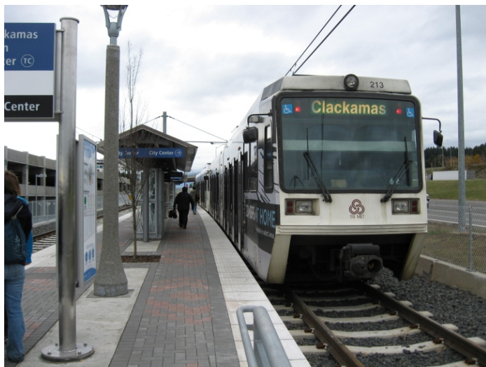
MAX 213 at Clackamas Town Center

large numbers of people boarding the train which became very crowded. With all the extra passengers, boarding required additional time that led to a slower trip to the Gateway Transit Center. Our planned transfer to the Green Line to Clackamas Town Center was impossible as the train departed just as we were arriving at Gateway TC.