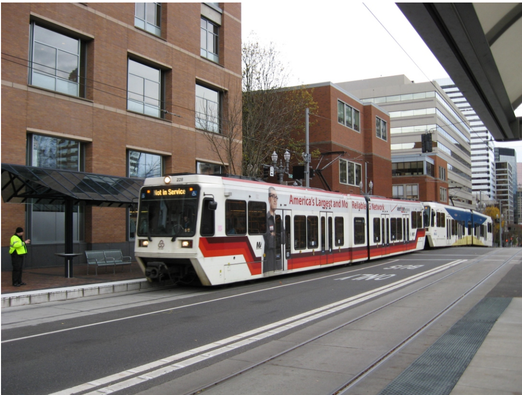
A good view of the MAX 2 color schemes taken on SW 5th near PSU. The second car set shows the newer color scheme. We were waiting for the Portland Streetcar.