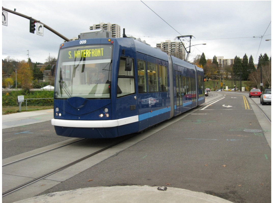
Compare the front of 009 as it is quite different from 006, We rode 009 for the rest of the trip on the Portland Streetcar line.

We walked to the MAX stop and rode on the Yellow Line car down 6th Avenue, around the circle in front of Union Station and crossed the Steel Bridge to the Rose Quarter Yellow Line stop. We walked over to the Blue Line stop for the train to Hillsboro. It was close to 5 PM so we were glad to find a seat as the car quickly filled with standees at the downtown stops. We arrived back at the Hatfield Transit Center about 6 PM. Remember, we assumed the trains would run on time, but who cared? Not a problem to true dyed-in-the-wool rail fans. The cost of the all day ticket was $4.75, what a bargain for a 9-hour excursion.