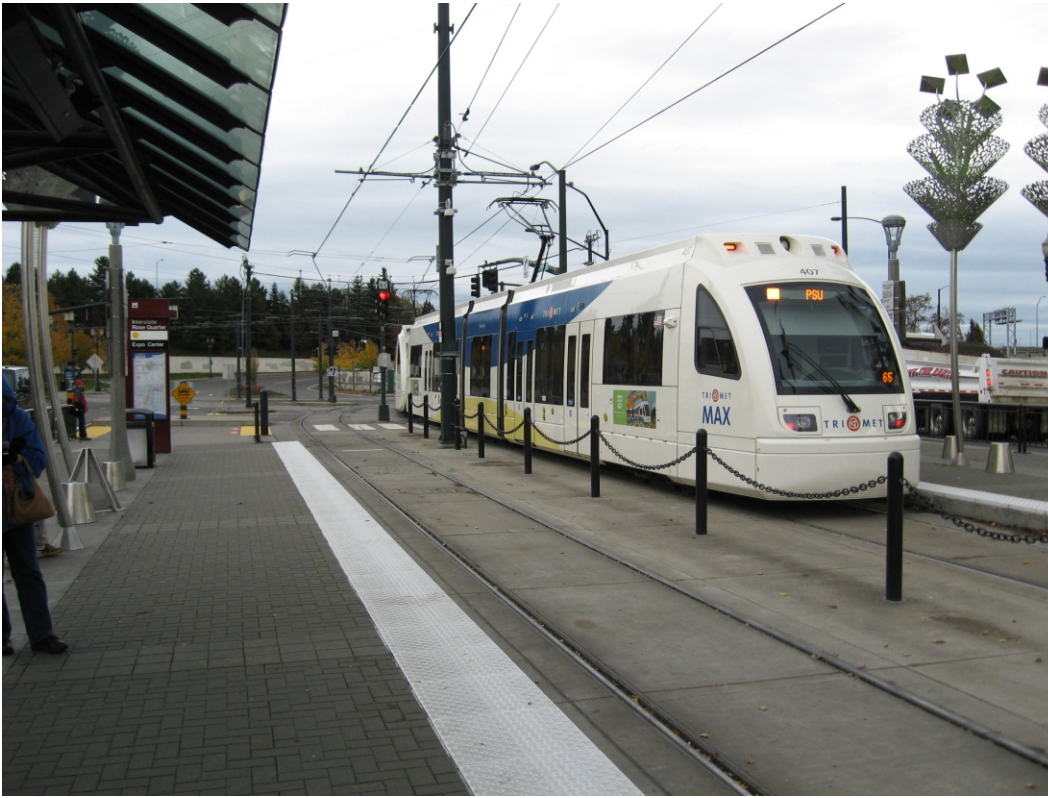
MAX 408 & 407, better view

heading down town. I don't know what the problem was for the outbound trains as it was 30 minutes before the Red line train to the Airport arrived. The ride to the airport was on a type 3 car with only a few passengers, but, as what happened previously, the departing train left as we were stopping. Another missed connection.