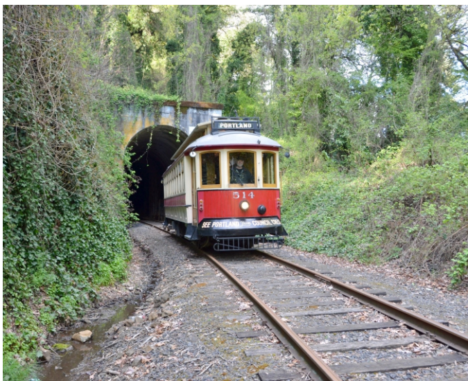
Hal Rosene at the controls of 514 on a training run emerging from the Elk Rock Tunnel on the Willamette Shore line.