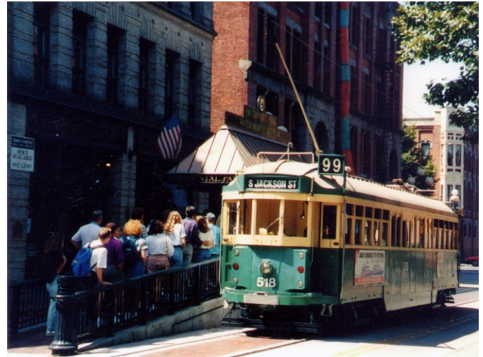
Waterfront streetcar on South Main St with high-level platform loading.

Compare the San Francisco waterfront back when the elevated Embarcadero existed and how it has been transformed after it was removed after the earthquake. The waterfront is a big tourist attraction with its antique streetcars, and likewise, when the Alaskan Way Viaduct is removed and the rebuilding of the waterfront is complete, I believe that the entire area east to 1st Ave. will undergo a surge of construction that will revitalize the entire area that will attract thousands of tourists.. A streetcar line is an essential part of the attraction.