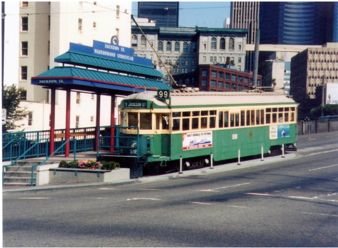
Car #518 of the Seattle Waterfront Streetcar at the Jackson St. terminus across from Union St.