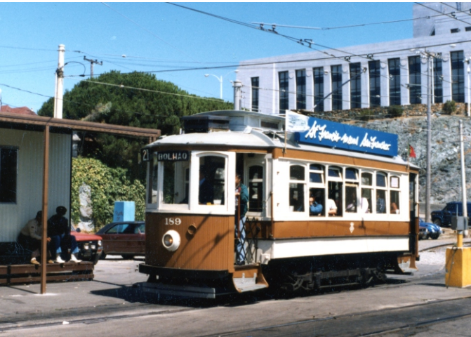
189 Porto tram at San Francisco Trolley Festival 1983