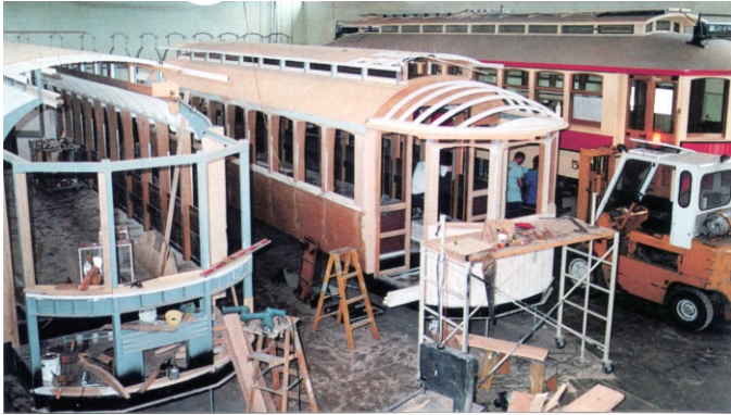
The first three Vintage Trolleys under construction at Gomaco factory in Ida Grove Iowa in 1991.

promotions into the historical narratives they delivered aboard the cars. In addition to the station sponsors VT was actively involved in enterprises like Saturday Market and Art Quake.