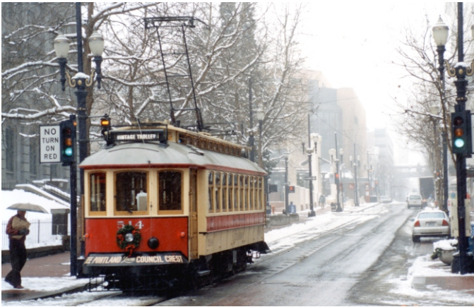
Car 511 passing Pioneer Court House on SW Morrison dressed for Christmas service in a snow in 1995.