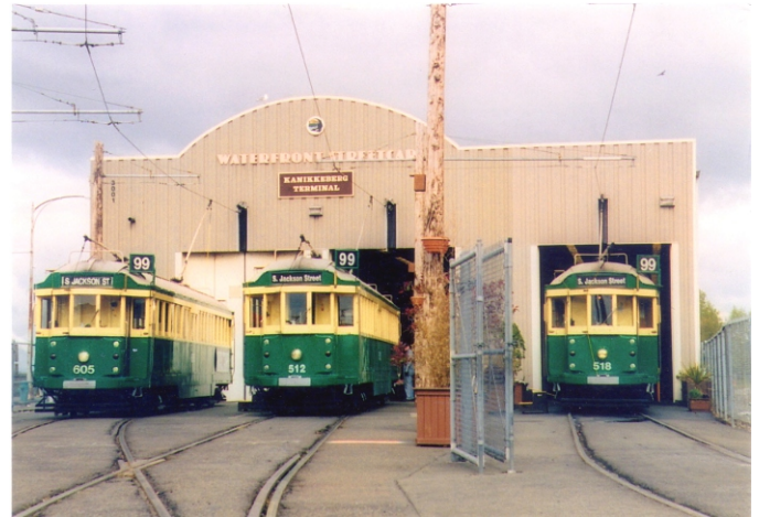
Waterfront Streetcar car barn and maintenance facility

Operation of the Waterfront Streetcar was suspended on November 18, 2005 replaced by a specially painted bus.