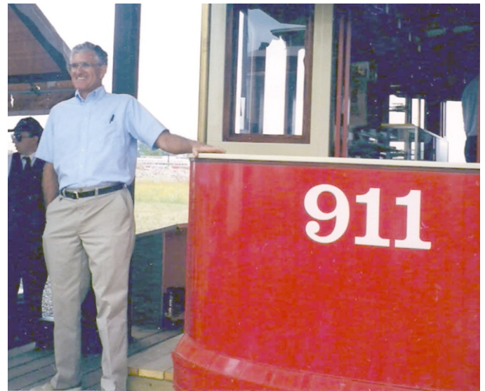
At the grand opening of the "911" museum shop.

Within a few months of retiring, he responded to a magazine ad seeking volunteers for the Oregon Electric