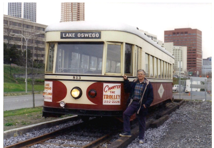
Next to car 813 which had just been placed in service on the Willamette Shore Trolley

Charlie then got involved in moving the trolley museum to Powerland. After being elected to the OEHRHS board, he secured a loan for the new car barn and was able to get a grant to complete Phase I of the OEHRHS Museum. He was also able to get a shop facility funded and constructed. Other activities he worked on included installing underground utilities, building roads, landscaping, and adding sprinkler systems.