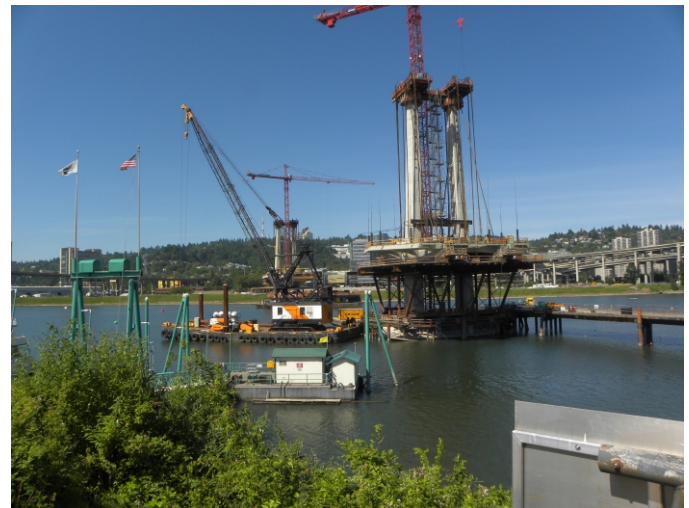
Twin towers of Milwaukie MAX line take shape near OMSI in Willamette River in S.E. Portland. The first of its kind, is this multi-mode bridge over the Willamette River that will carry busses, bikes, light rail, pedestrians and a future Portland streetcar extension. Cars will not be able to use this bridge.