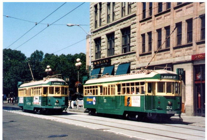
Waterfront streetcars posing on South Main Street.

So, what is happening now? The Seattle central waterfront is in the beginning stages of a complete rebuilding of the infrastructure that could take up to a decade to complete. Construction of the State Route 99 tunnel to replace the Alaskan Way Viaduct is underway and is scheduled to open in 2018. The viaduct will then be razed to clear the way for construction of new pedestrian promenades. Work on rebuilding of the seawall is underway starting with infrastructure replacement. The actual construction to rebuild the seawall is scheduled to begin in September. A new Washington State Ferry Terminal will be built to replace the present terminal. The preliminary design of the Waterfront Development Project