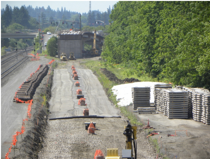
Looking South from Bybee Blvd overpass toward Milwaukie. Note Tacoma St overpass in center of photo. Also, notice rail stacked in center of photo and concrete ties stacked to the right.

Construction of the Milwaukie extension is making great changes in the landscape along its route. A new bridge, several overpasses and several businesses have relocated to new and larger facilities. Siemens is constructing new LRV's at its plant in Sacramento which after delivery will bring the fleet to 145 cars.