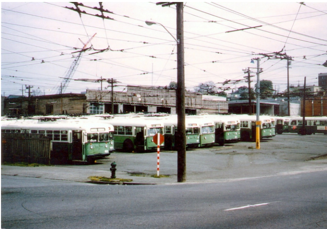
Trolley coaches that would replace streetcars in 1950s at the old streetcar barns