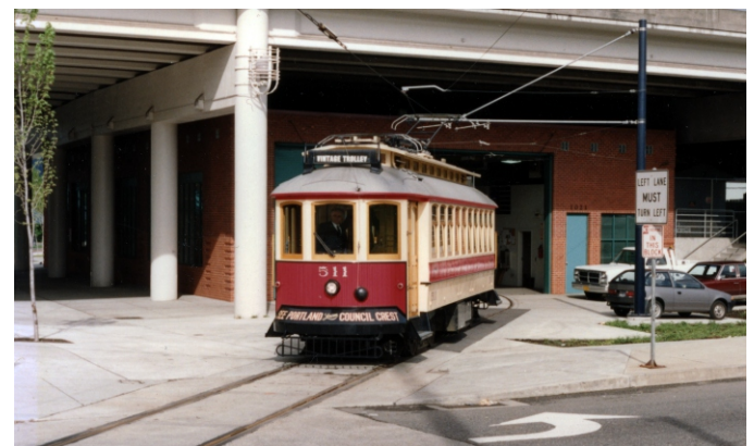
Car 511 leaving VT Car barn with the late Bill Wegesend at the helm early 1992