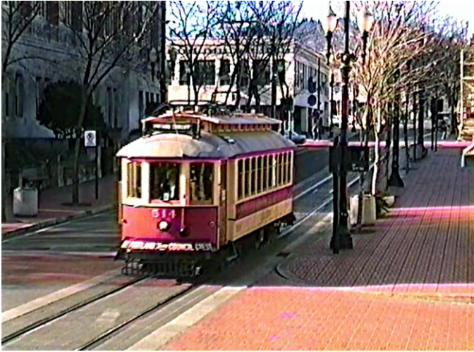
Car 514 passing Central Library January 1992