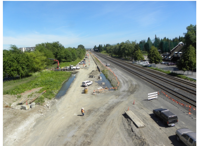
Looking North toward Portland from Bybee overpass.

The new line opens in September 2015 and extends the MAX system to 60 miles and 97 stations.