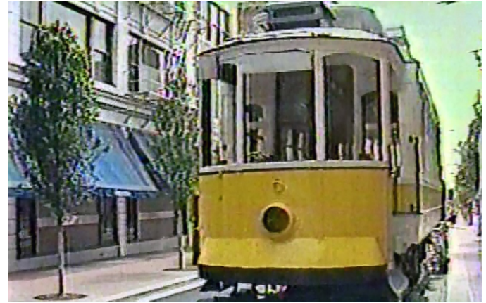
June 1985, Porto car No. 178 on display on the MAX tracks then under construction alongside the Galleria Mall in downtown Portland.