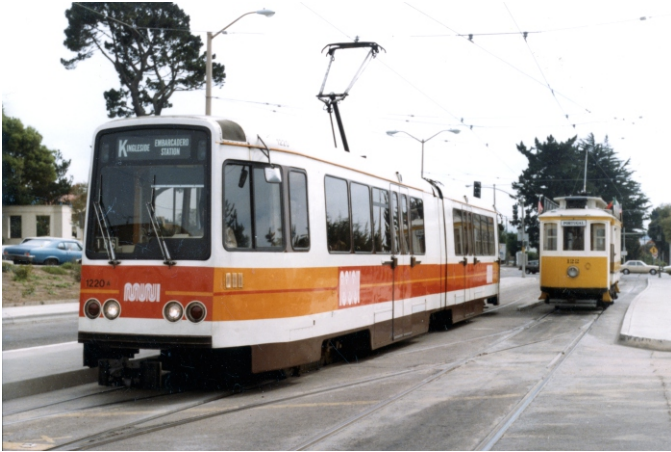
122 Oporto and 1220 Muni at first San Francisco Trolley Festival summer 1983