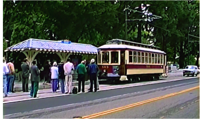
Council Crest 503 at dedication of VT Line June 26 1991