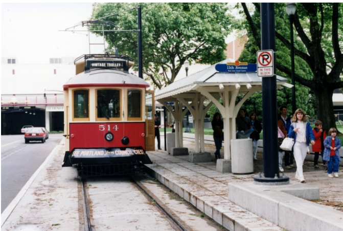
Car 514 Vintage Trolley at Red Lion Lloyd Ctr Station early 1992

This summer No. 514 will begin a new career on the Willamette Shore Trolley, where it will be enjoyed by more members of the riding public than its sisters will on the Portland Transit Mall. Car 513 will also be available when needed. Of one thing I am certain; these "faux vintage streetcars" now wear the patina of history.