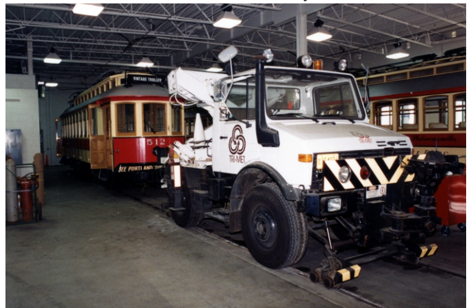
Car 512 was last trolley to arrive at VT Car barn towed in by Unimog at 5 am May 1 1992

Since VT cars shared tracks with MAX, union regulations stipulated that they have TriMet operators. Additional crews on the two-man streetcars were provided by VT. These employees, referred to as "hosts" by TriMet, fulfilled the duties of what is traditionally called a conductor.