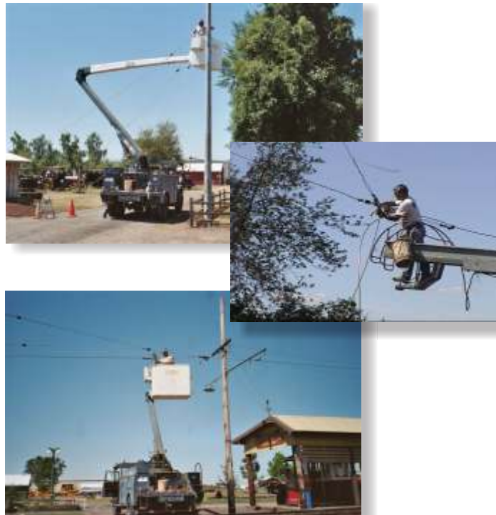
Greg working in the lift bucket on overhead for the extension to the Brooks museum depot. Another photo shows him attaching pull off wires for curve between sawmill and truck museum. The work on the rail extension was in 2003.

Fortunately, I had something that I never had to leave behind and always something new to play with whenever I had the chance to visit. While most kids went camping or fishing or went to the beach, dad and I went to the Trolley Museum. As one of the founders, he made the trip often