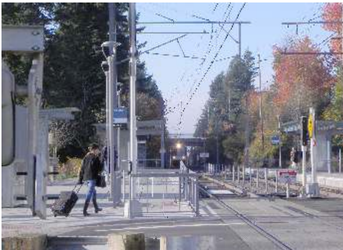
Civic Drive Station...NEW 212th overpass in background.