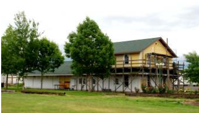
Interpretive Center June 9th, 2012. Work is progressing on siding and exterior painting. When this is completed, now

Progress was made on the interior with completion of the two hour fire barrier in the attic space between the public area and the living quarters on the second floor. This included the floor above the restroom and the entry to the second floor. The heating and cooling system for the restroom and bookstore has been installed and ducts connected. Equipment drains have been run with overflows to the exterior of the building. Overhead