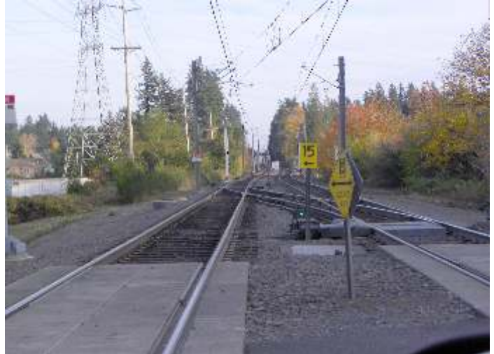
Looking East toward Gresham from Ruby Station. Originally this was one track to end of line.