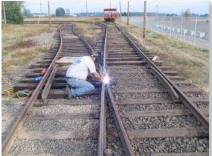
Greg welding rail at the Brooks museum in 2009.