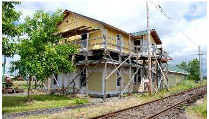
targeted for the end of July, the scaffold will be removed.

Stop by often this summer to view the progress, get a chance to see it before it's done. ■