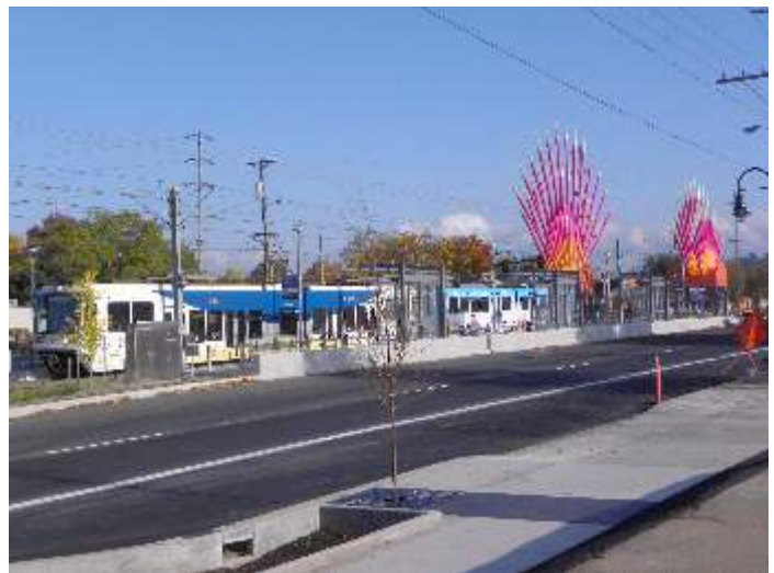
New Rockwood MAX Station

So, plans were drawn up to extend two tracks East from Ruby Junction thru a gully to Cleveland Avenue which resolved the problem (and you will see in some photo's I took). Since that time, a lot of changes have taken place. A new shopping center called Gresham Station was built parallel to the line along with