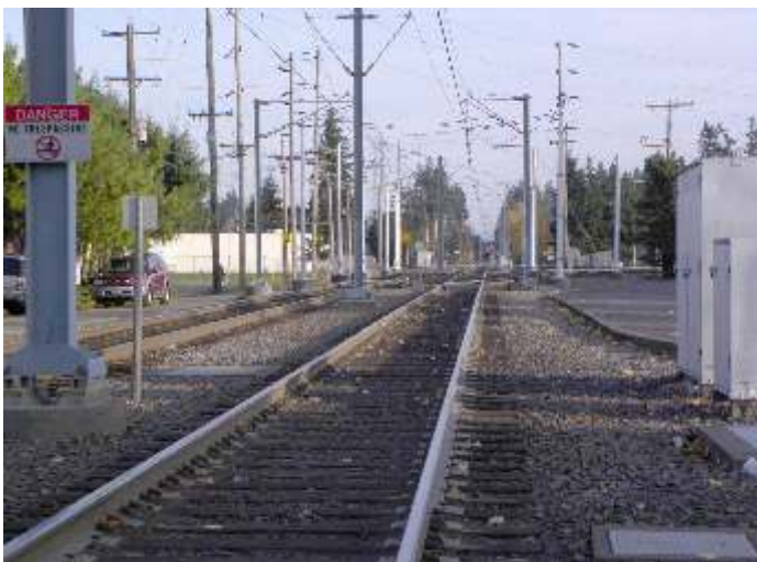
Taken from N.W. Birdsdale at Ruby Junction which is now two tracks looking East