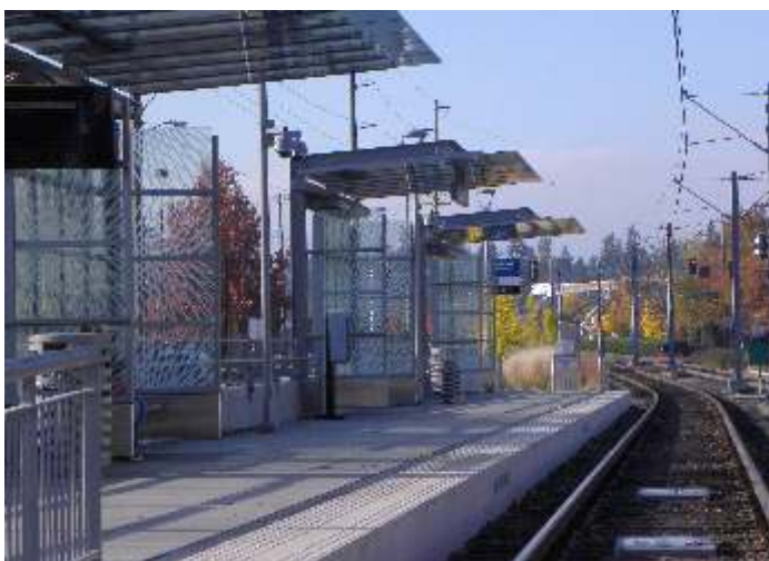
New Rockwood MAX Station