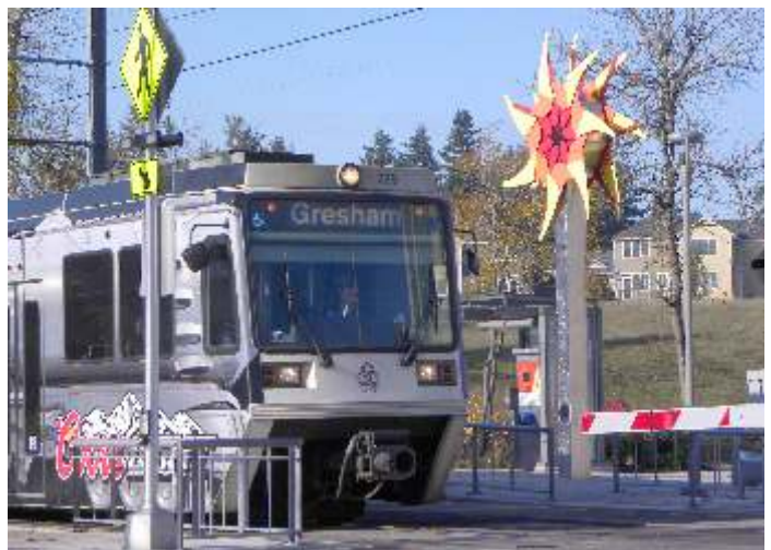
Another view of Civic Drive Station and art at station with Gresham train heading toward end of line.