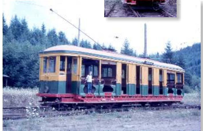
Greg at age 5 on 1187, the open Sidney, Australia car, his first time at the controls (with dad's help of course). In the top photo, you can just see his head barely over the lower window sill.

and while we didn't always live that close, he managed to make the time to go.