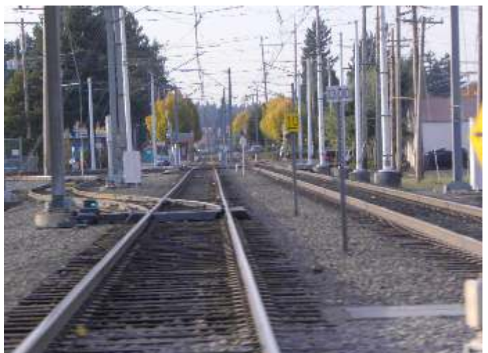
Looking West from Ruby Junction.