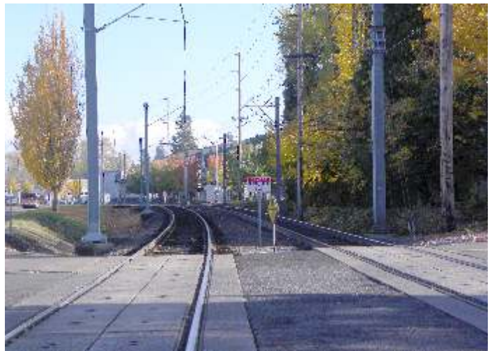
Looking East from Gresham Central Station toward Cleveland Station and end of line.