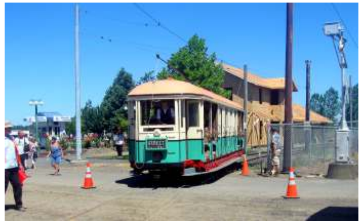
2010 Steam-Up. Trolley Rides with the early Interpretive Center construction in the background.

Other Attractions: Blacksmithing, a country store, models, early electricity exhibit, miniature farm display, children's passport program, swap meet and flea market sales, country music, and great food! Church services held Sunday mornings at 8:00 a.m.