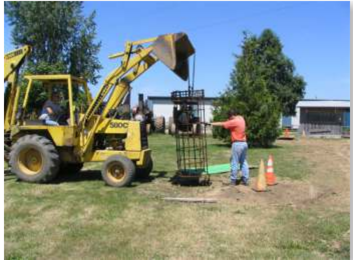
John Nagy is working with Greg placing rebar cage for the foundation for the steel poles.

Three old friends are still waiting in the car barn for their chance to come out and play again and my plans are to be there when they do. ■